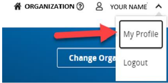
Figure 1 - My Profile Button